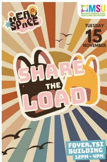
Figure 1 Graphic for Share the Load, with amazing work from Tyran per usual.