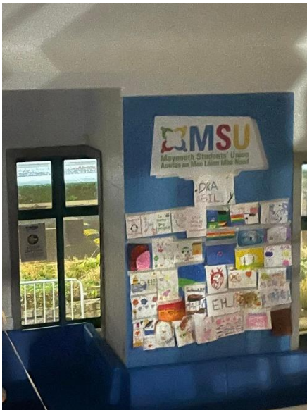
Figure 6 A collage of narrativized images from Draw Ability.