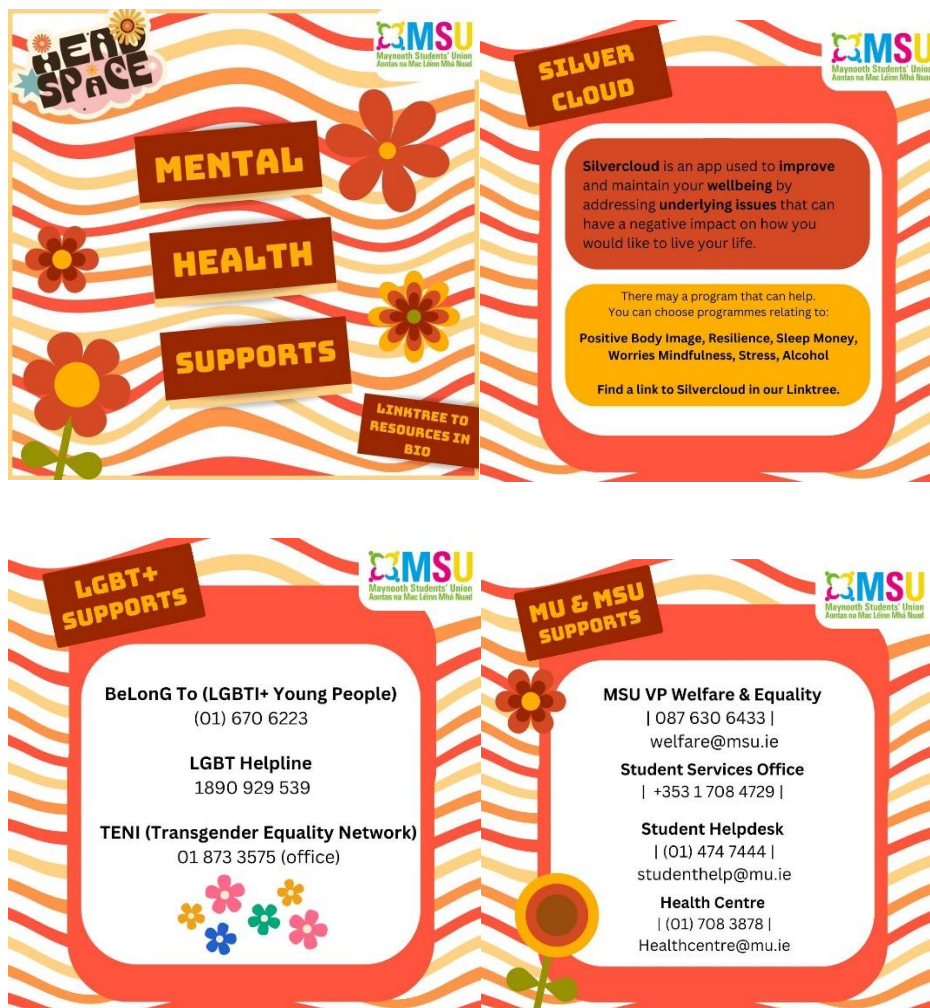
Figure 9 A Set of Mental Health-Related Graphics for Headspace.