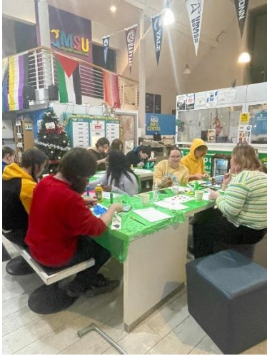
Figure 5 Students painting during MSU's Draw Ability session.