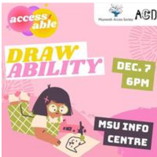
Figure 4 Draw Ability Advertisement, with amazing work done by Tyrán.