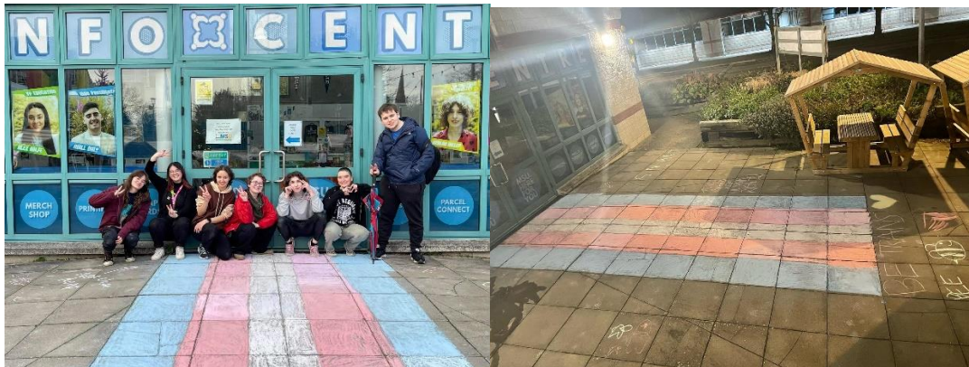
Figure 10 Giant Chalk Trans Flag w/ Pride Soc.