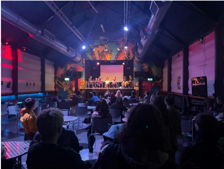
Figure 3 Room Overview of Hidden Disabilities Panel.