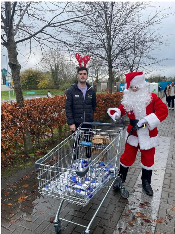
Figure 11 Canta and Co. carrying illegal goods through airport security.