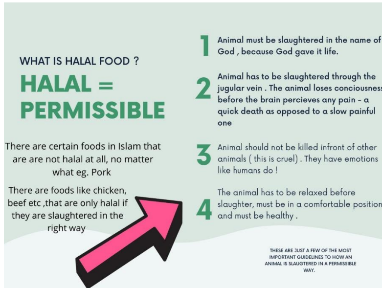
Figure 8 Our Froebel Senator's invaluable graphic outlining what is Halal.