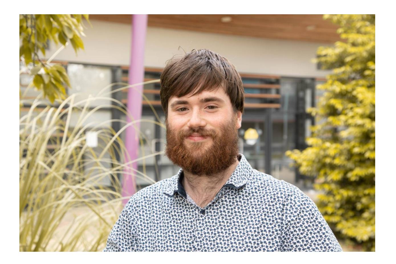
Image Description: My official Officer Photo. I am standing in front of the Arts Annex in a leaf patterned shirt. There are vibrant yellow and green plants surrounding me and I am smiling. My hair is being blown slightly by the wind and my beard is a lot shorter than it is now!