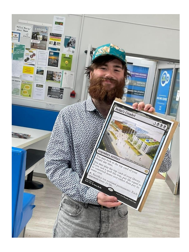
Image Description: I am standing in the MSU Info Centre following my attendance at the #WheresMyLevy Walkout. I am holding my sign from the event, a giant print out of the Magic: The Gathering trading card "Bolas's Citadel". The artwork for the card has been replaced with artwork of the now cancelled Student Centre. I am wearing the same leaf patterned shirt from my Officer Photo. I am also wearing a green floral patterned hat and grey jeans. My beard is very full and fluffy and my hair is poking out from under the hat slightly.