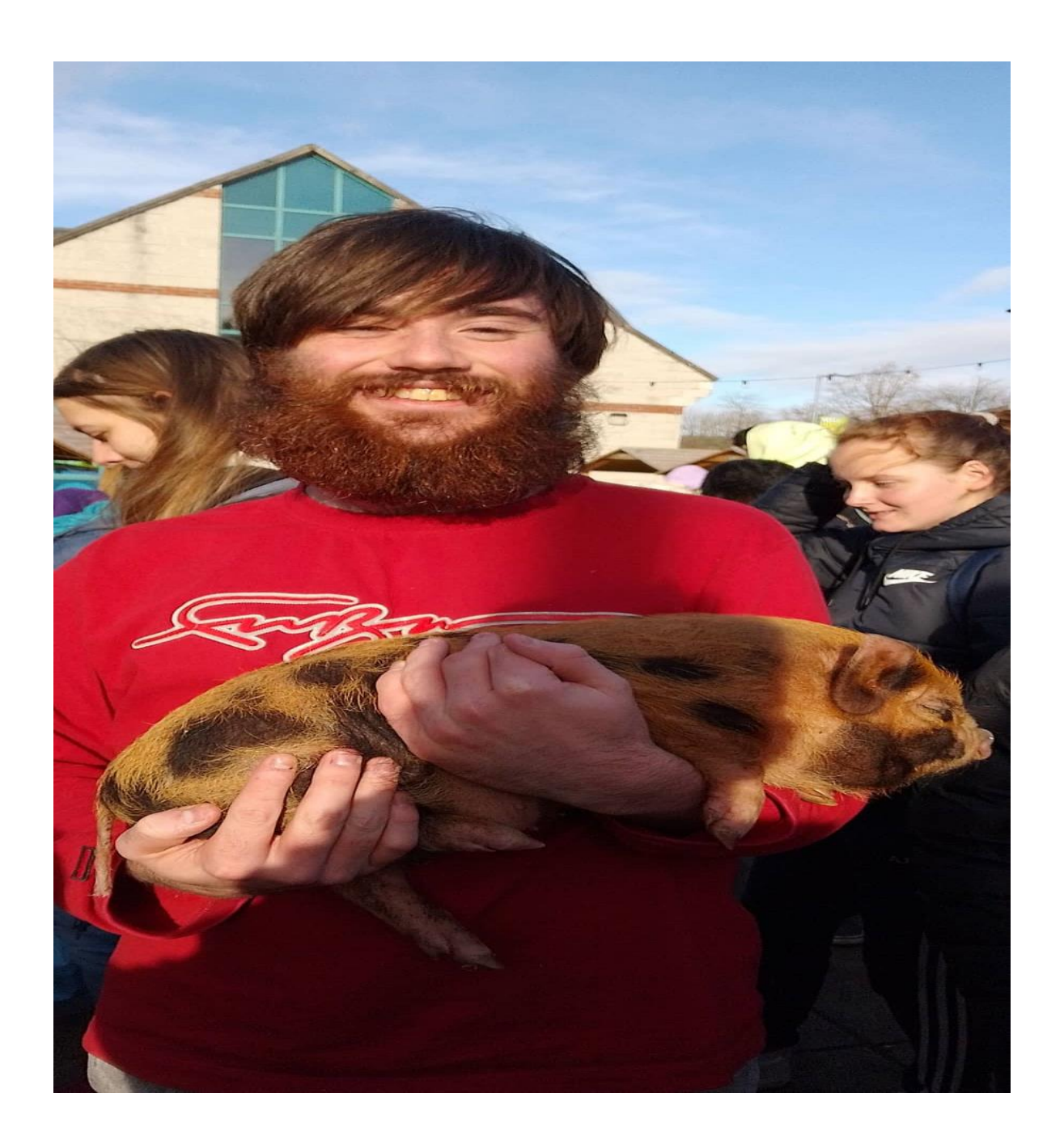
Image Description: A picture of me attending the Baby DeStress Animal Petting Event. The photo is a wide shot of myself and a pig. I am holding the pig. I am wearing a red long sleeve shirt while holding the pig. The pig is relaxing in my arms. The arms that are holding the pig. I have a massive smile on my face as I hold the pig.