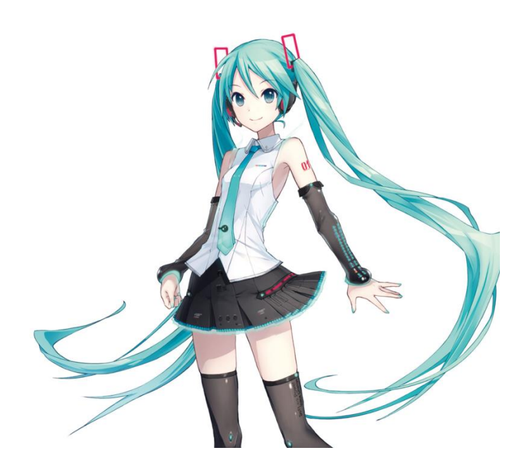
Image Description: Official Artwork of Hatsune Miku (Japanese: 初音 \stackrel{?}{=} 2), a Japanese Virtual Idol developed by Crypton Future Media. She has turquoise eyes and her hair is also turquoise. Her hair is styled into a twintails style, held in place by two large red hairclips that are also part of her red headphones. She is wearing a sleeveless white shirt with a turquoise tie and black skirt, gloves and leggings. Her gloves and skirt are adorned with a series of red and turquoise lights. She has a visible red tattoo of the number "01" on her left arm.