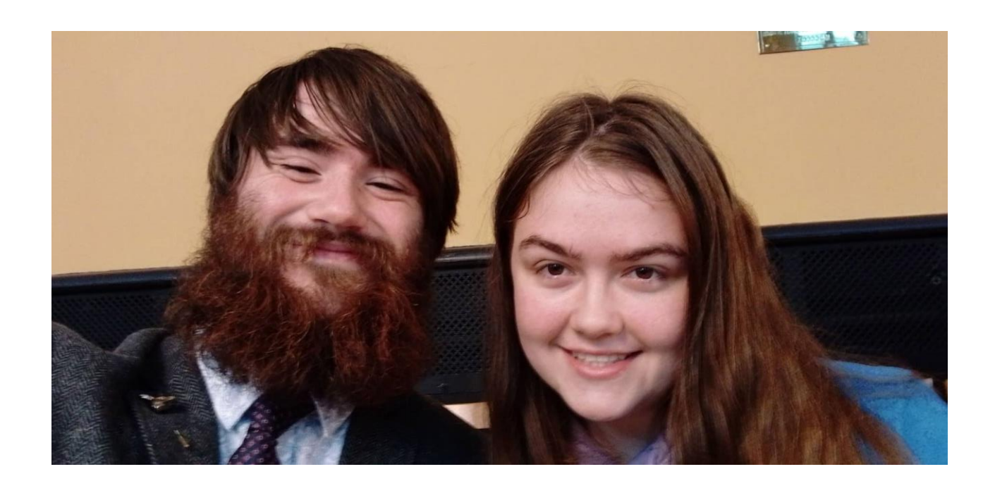
Image Description: A landscape selfie of myself and the Accommodation Senator Luka Pranciliauskas inside Pugin Hall. We are attending a different graduation and as such are smiling very happily as we watch the different group of happy graduates.