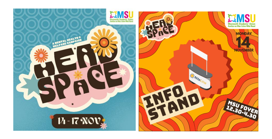
Figure 1 All Headspace Events with Graphics