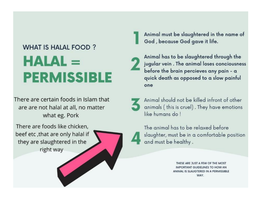
Figure 4 Our Froebel Senator's invaluable graphic outlining what is Halal.